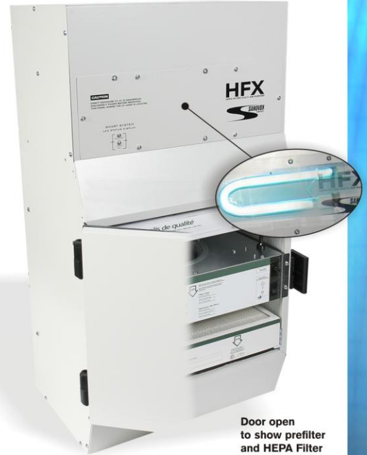
Door open to show prefilter and HEPA Filter

By combining HEPA Filtration & UV Purification, Sanuvox is able to offer a complete IAQ solution with one unit.